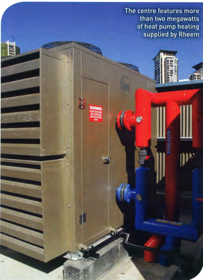
The centre features more than two megawatts of heat pump heating supplied by Rheem

The smart controller also enables the temperature of the water to be automatically adjusted during tariff changes.