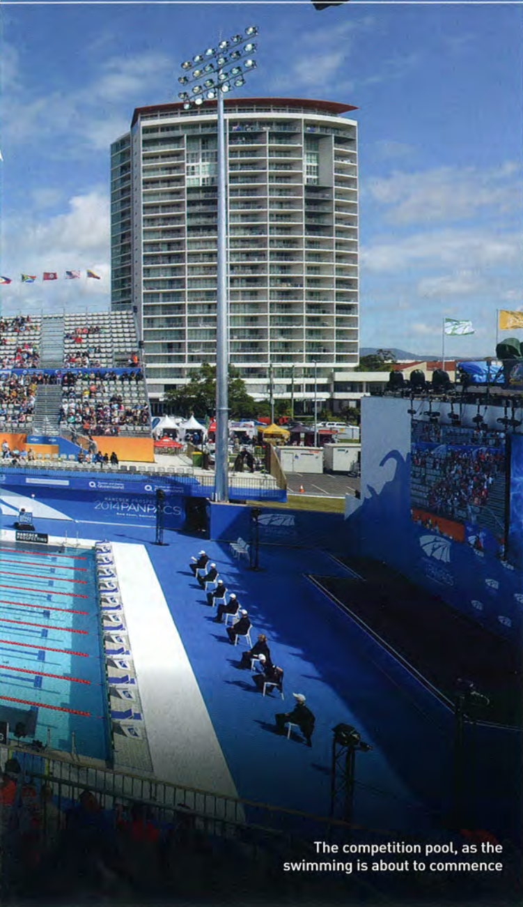
The competition pool, as the swimming is about to commence

“The right solution for the event might not be the right solution long term.”