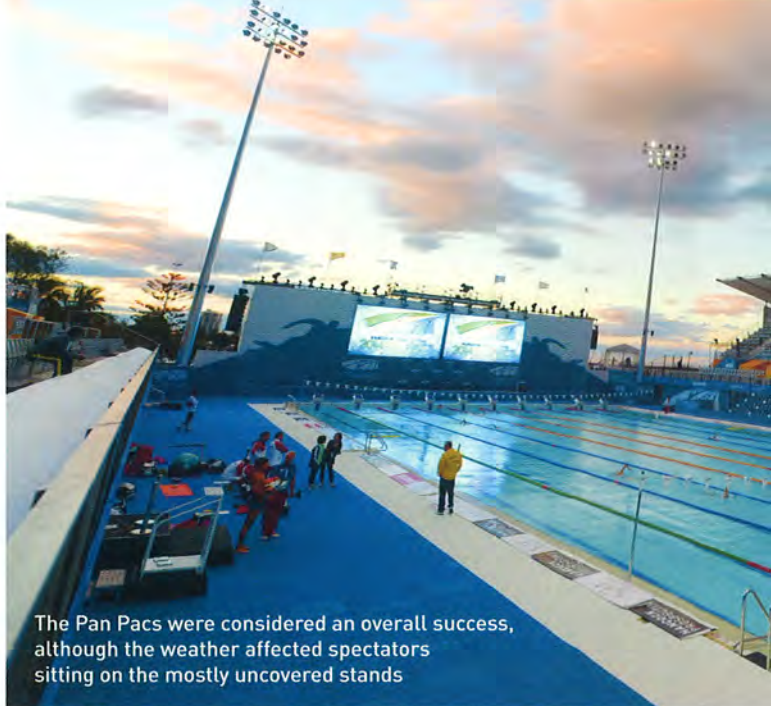
The Pan Pacs were considered an overall success, although the weather affected spectators sitting on the mostly uncovered stands

Community use will include lap swimming, training, aquatic fitness and school competitions, and during the summer holidays they will provide less structured recreational activities, such as putting inflatables in the pools and opening up the dive boards under supervision.