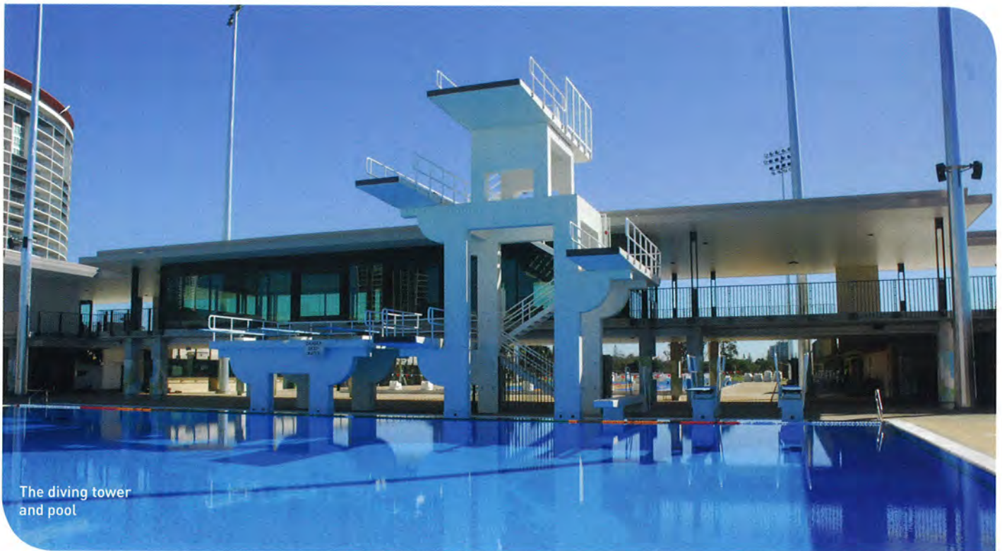
The diving tower and pool