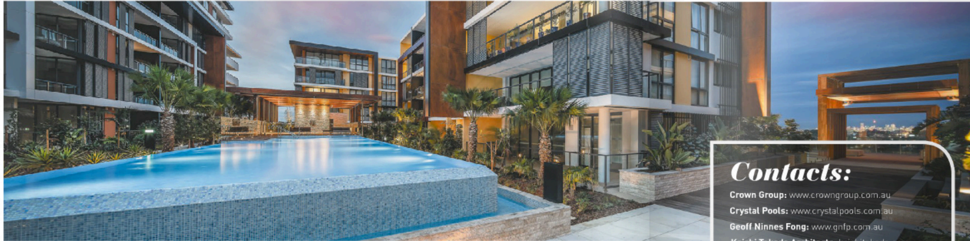
Premium pools are helping attract buyers to new residential complexes

"Crown have been very active. There's been a bit of a resurgence. I'm not sure how long it will continue for, but they keep buying space and the units keep going up. Also, there's a lot of investment coming in from Asia, and a lot of the units are pre-sold off the plan."